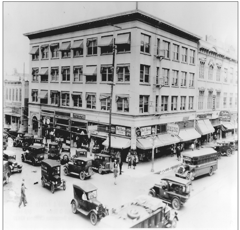
Downtown San Bernardino 1927