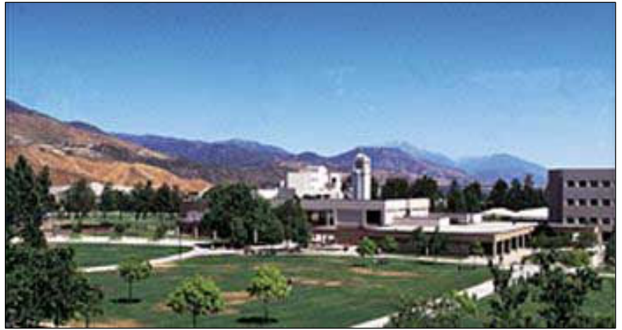
Cal State University San Bernardino

California State University San Bernardino is one of the Inland Empire's largest trainer of business managers. Cal State's School of Business and Public Administration is accredited by the American Assembly of Collegiate Schools of Business (AACSB) at both the under graduate and graduate degree levels. With more than 17,000 students enrolled in more than 50 undergraduate degree programs, Cal State San Bernardino is one of the fastest growing campuses in the state university system.