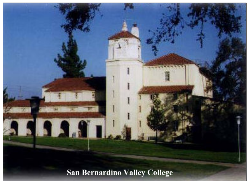
San Bernardino Valley College

Within an hour's drive, San Bernardino is the link to national markets, Mexico, and the Pacific Rim. Local bus service connects ten cities in a two county area and provides access to transcontinental bus connections.