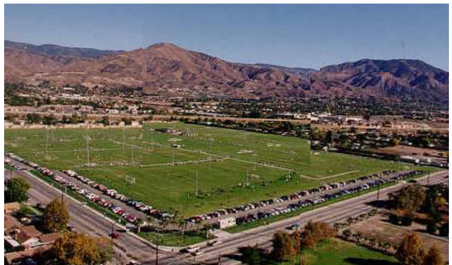
San Bernardino CYSA Municipal Soccer Complex

The complex is home to a number of tournaments and activities throughout the soccer season. The complex provides increased revenue to the San Bernardino local economy from use of the local restaurants and hotels as well as overall operational support of the tournaments.