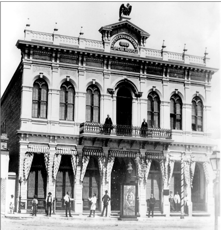
San Bernardino City Opera House 1882

Today San Bernardino has emerged into a modern urban community with a bright future. The enduring spirit and vitality of yesterday's pioneers are still evident and reflected in the pride of community.